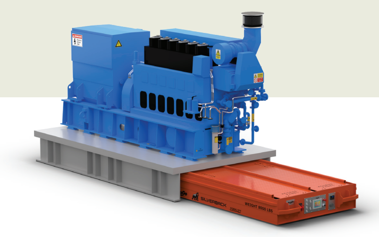
WV-H100T marine diesel engine refurb application