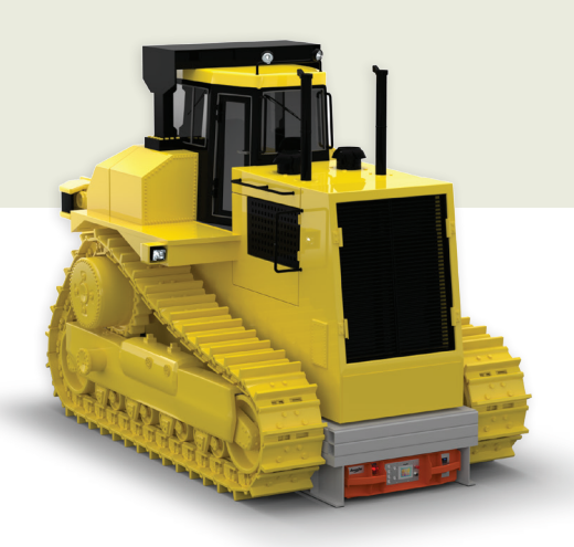
WV-H65T heavy equipment conveying application