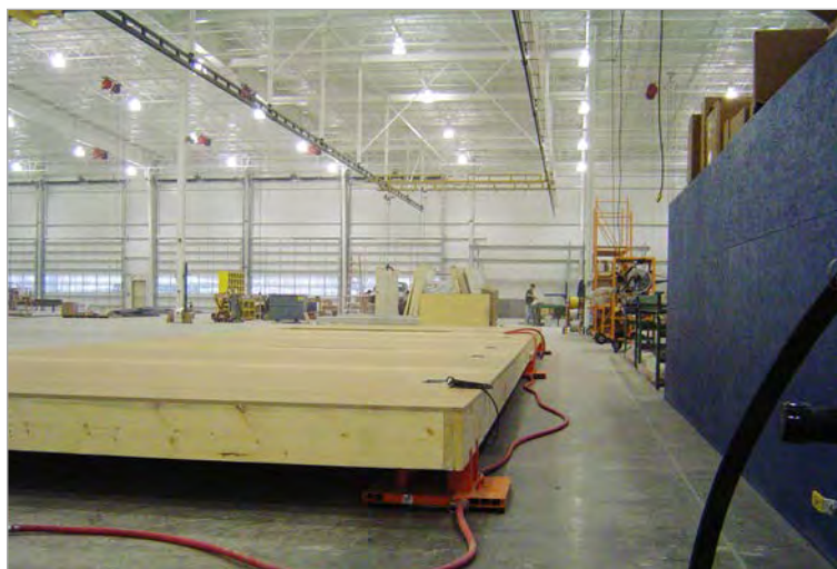
The modular building industry can often promise 30-50 percent quicker project completion times than traditional onsite building projects.

With the use of air caster technology, the building components are assembled inside a modular building factory on top of air caster-supported platforms. The air casters allow for complete omnidirectional movement of the buildings from the early, lighter framing stages to the final, heavier stages where doors, siding, floors, roofs, and sometimes bathrooms, fireplaces and inside structures are added, depending on specifications. The finished units can be as large as 16 feet by 72 feet, and from 20,000 to 60,000 pounds. When these unwieldy buildings or components are gently moved on a cushion of air, fewer workers are needed to transport the structures, fewer accidents occur, less damage is done to the manufactured modular building and the work facility. With air casters, there is more control, less jerking, less worker fatigue, and stress. Also, the buildings are moved to the workers' stations, much like on an automobile production line, instead of workers moving to the buildings stationed around an assembly plant. This timesaving is how the modular building industry can often promise 30-50 percent quicker project completion times than traditional onsite building projects. Air caster technology improves production speed and makes meeting these ever-more demanding deadlines possible.