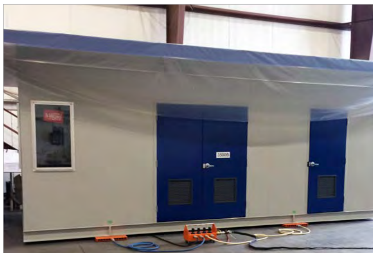
Portable structures move through manufacturing process on air caster rigging systems.

Tighter completion schedules put pressure on production, which often requires more (skilled) workers, paying premiums for faster delivery, re-scheduling, and regrouping at the cost of other opportunities. Delays by weather, supply chain, and insufficient manpower complements can thwart completion schedules, and worsen with each unmet deadline.