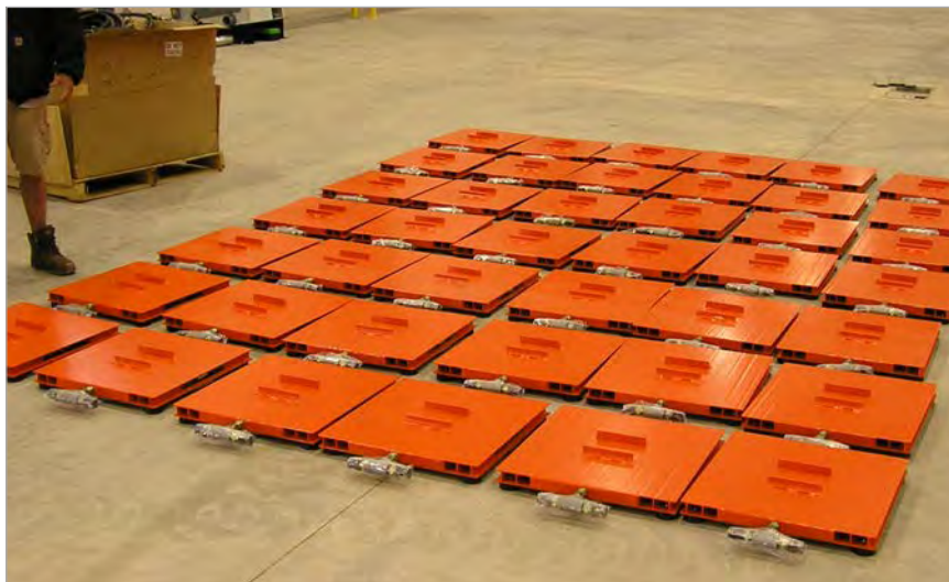
Customized supports match manufactures' process requirements.