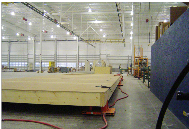
The modular building industry can often promise 30-50 percent quicker project completion times than traditional onsite building projects.

With the use of air caster technology, the building components are assembled inside a modular building factory on top of air caster-supported platforms. The air casters allow for complete omnidirectional movement of the buildings from the early, lighter framing stages to the final, heavier stages where doors, siding, floors, roofs, and sometimes bathrooms, fireplaces and inside structures are added, depending on specifications. The finished units can be as large as 16 feet by 72 feet, and from 20,000 to 60,000 pounds. When these unwieldy buildings or components are gently moved on a cushion of air, fewer workers are needed to transport the structures, fewer accidents occur, less damage is done to the manufactured modular building and the work facility. With air casters, there is more control, less jerking, less worker fatigue, and stress. Also, the buildings are moved to the workers' stations, much like on an automobile production line, instead of workers moving to the buildings stationed around an assembly plant. This timesaving is how the modular building industry can often promise 30-50 percent quicker project completion times than traditional onsite building projects. Air caster technology improves production speed and makes meeting these ever-more demanding deadlines possible.