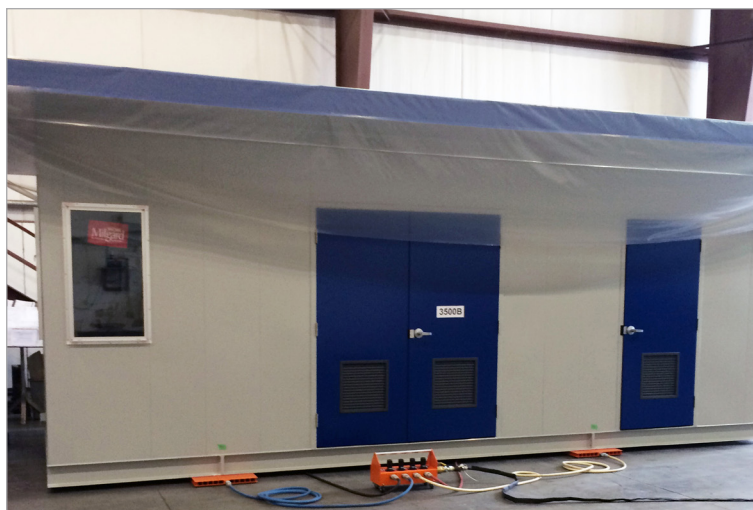
Portable structures move through manufacturing process on air caster rigging systems.

Tighter completion schedules put pressure on production, which often requires more (skilled) workers, paying premiums for faster delivery, re-scheduling, and regrouping at the cost of other opportunities. Delays by weather, supply chain, and insufficient manpower complements can thwart completion schedules, and worsen with each unmet deadline.