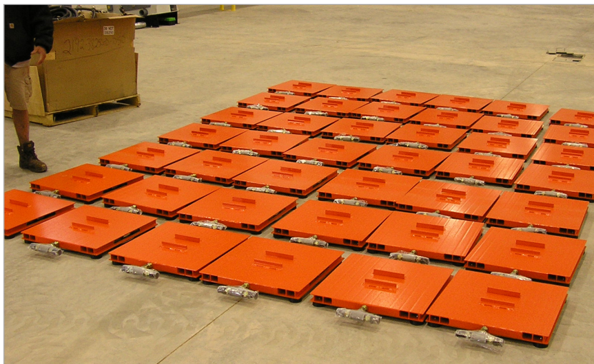
Customized supports match manufactures' process requirements.