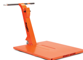
Aero-Pallet with optional J-handle