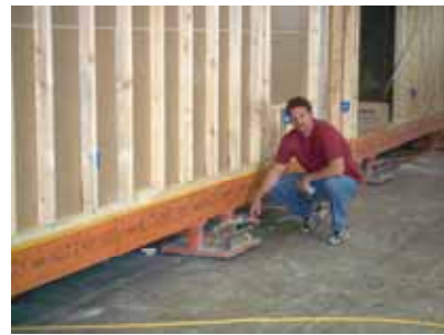
AeroGo Load Beams positioned under home frame.

"Our factory already runs mainly on air," Fink pointed out. "All of our tools, routers, nailing tools, and things like that are air driven. We already had the capacity to use air as a source of movement on these Aero-Casters and our air compressor was big enough to handle it. The cost of the Aero-Casters was probably 10% less than all of those steel rollers and all of that stuff. We already had the capacity to use air as a source of movement on these Aero-Casters, and it seemed like we could incorporate it with our other rolling system. And I liked the idea of the floor being clear for housekeeping purposes, trip hazard safety and things like that. A big effort of our company is to keep a clean factory—for a lot of reasons. Safety is one of those. We also do