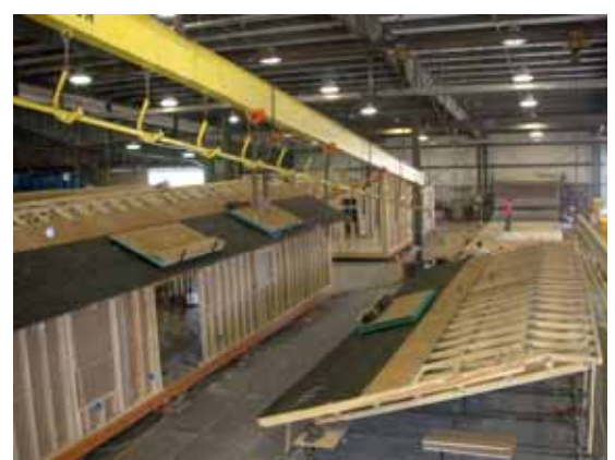
Heritage Home's new expansion facility better utilizes space for increased production.

a lot of tours here and it's a pride thing. We want customers to know that we're treating their new home correctly and give them a sense of well-being. If you go into somebody's house that is very messy, you start wondering how organized they are."