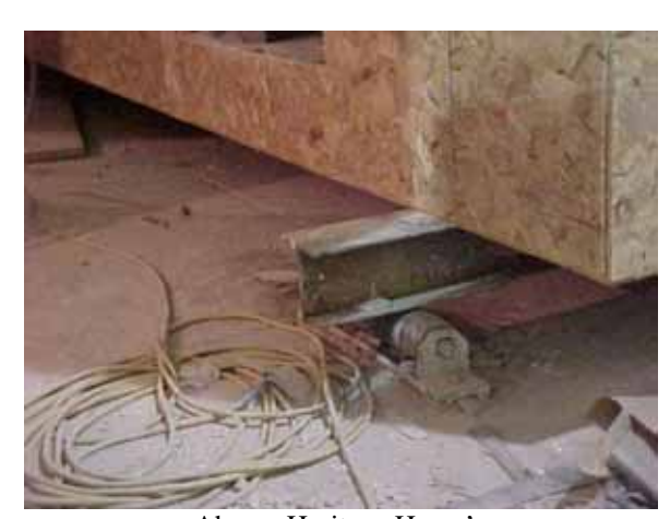
Above, Heritage Home's <u>old</u> assembly line floor fixtures.

One measurable key to cost-effectiveness has been their choice of the AeroGo Aero-Caster Load Beams to move the weighty home modules through their production line system. When Heritage completed their last plant expansion they took a fresh look at their modular moving technology. "The factory has been here since 1978," Fink explained. "At that time, the conventional way of moving modular units, or modular units down our production floor was either on rollers or wheels attached to the house or a track system. Our system was similar, with six parallel rows of rollers running down the length of the factory. We mounted the