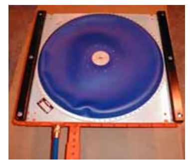
DuraGlide Aero-Caster beneath each end of the Load Beam

sections along on beams and having it fall off the rollers, but backs can be injured by the stress of pushing boxes. In comparison to rollers, with AeroGo Aero-Casters the heavier