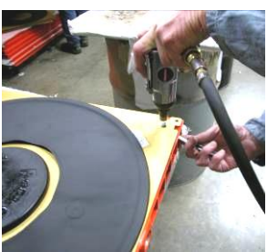
STEP 2: Remove the center bolt, center landing pad, and corner mounting bolts. On 27-inch models and larger, corner pads and a center pad are used. (NOTE: For Gapmaster models, no center-landing pad is used. Instead, cornerlanding pads are used.) Be sure to save all hardware.

STEP 3: Clean mounting structure and remove any old double back foam sealing tape with scraper (utility knife or similar) to provide a smooth, clean and dry surface to apply new seal tape.